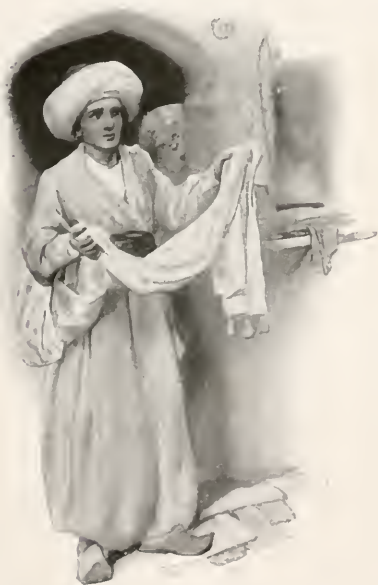
Said was to stand at the door of the shop and show off the wares.

the enraged lady, "not to provide sufficient porters. But there stands a great idle fellow, he shall carry home my parcel and I will give him a coin for his pains."